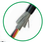
Joint supplied with armour continuity device