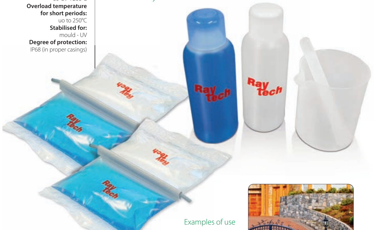
Examples of use